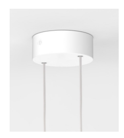
White Fabric Flex Cable