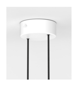
Black Fabric Flex Cable